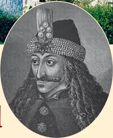
Vlad the Impaler ▶