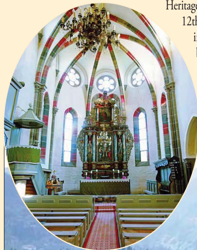
◀ Biertan Fortified Church

Visit Transylvania's symbol, Bran Castle. The edifice owes its fame both to its unique charm and to the myth Bram Stoker created around Dracula. Documentary evidence of the castle dates back to 1377. Close to the castle there is a shrine that is set in the wall of a mountain which once sheltered the heart of Queen Maria of Romania. Your next stop is the Medieval Saxon City of Brasov. Three quarters of the city is surrounded by mountains, and it is one of the best preserved medieval cities in Europe. The most famous landmark of Brasov is the Black Church , the largest Gothic edifice in South – Eastern Europe. Next stop, a UNESCO World Heritage Site, Sighisoara Medieval Citadel. Founded by Saxons during the 12th century, Sighisoara still stands as one of Europe's most beautiful inhabited fortified citadels, the place where Vlad the Impaler was born. Your accommodation is in a charming 3* hotel located in the heart of the medieval citadel. Enjoy a Saxon dinner.