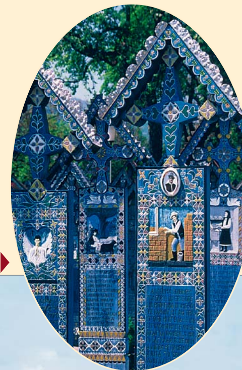
Merry Cemetery, Săpânța, Maramureș ▶