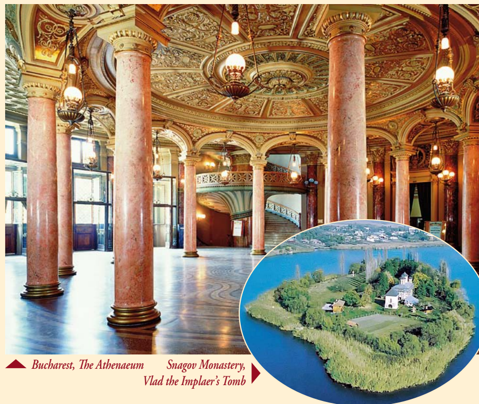
▲ Bucharest, The Athenaeum Snagov Monastery, Vlad the Implae's Tomb ▶