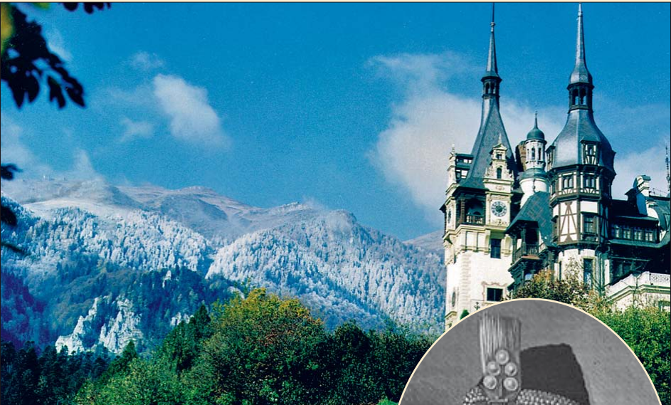
▲ Peleş Castle