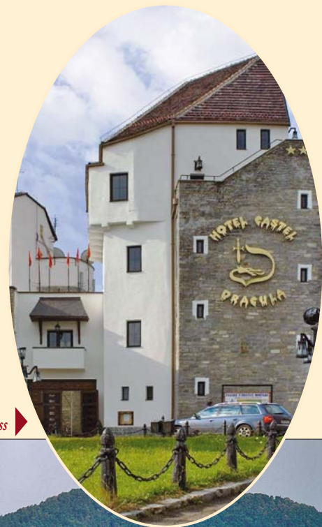
Dracula Hotel from Borgo Pass

Czech Republic - Teresin Concentration Camp, Sedlek Ossuary, Church of Saint Barbara, Kutna Hora local museum Hungary - House of Terror, Fisherman Bastion, Mátyás Church, Visegrad Castle Romania - Turzii Gorges, Dracula's Castle in Borgo Pass, Clock Tower, Medieval Weapon Collection and Torture Room, Bran Castle, Horror Castle, Rasnov Citadel, Village Museum in Sibiu, Princely Court in Tirgoviste, Snagov Monastery, Old Princely Court in Bucharest.