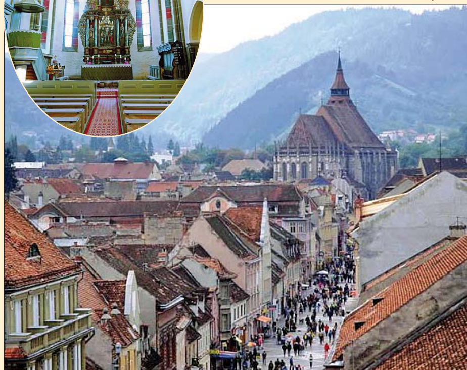
Black Church in Braşov ▼