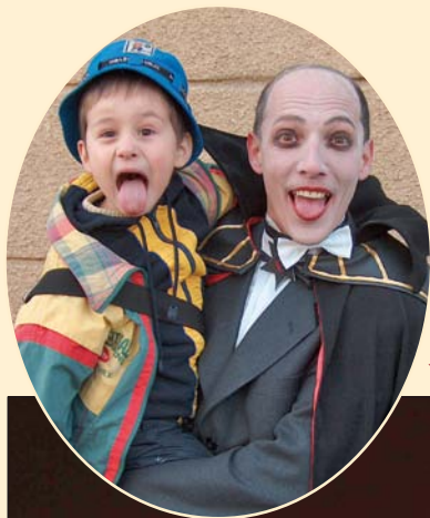
► The Witch Trial Show Team

One of the best preserved medieval cities in Europe