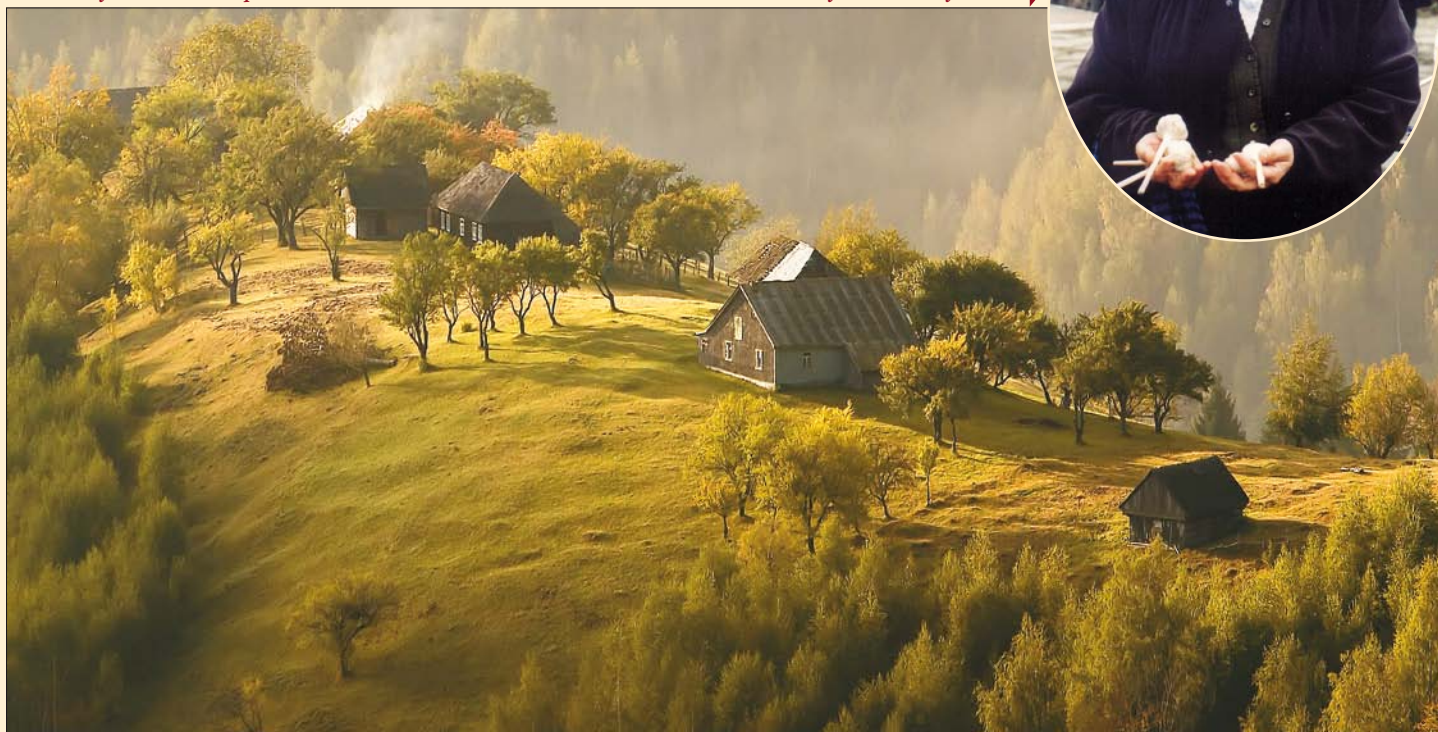
Transylvanian Lucky Charm ▶