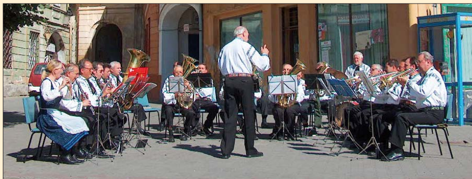
Medias Street Concert ▲