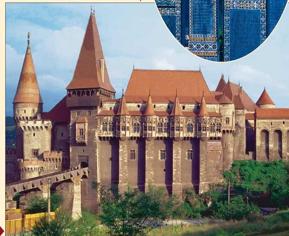
◀ Corvinesti Castle, Hunedoara ▶