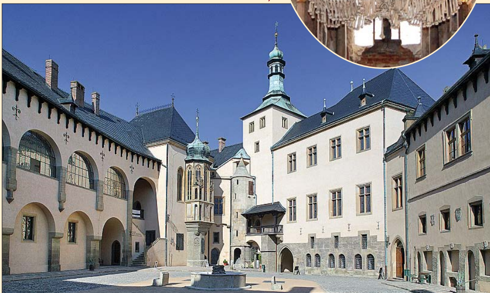
Sedlec Ossuary – the chapel decorated with human bones